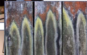
"Lichen Flames on the Hayshead Wall - Randalls Bay 2010"